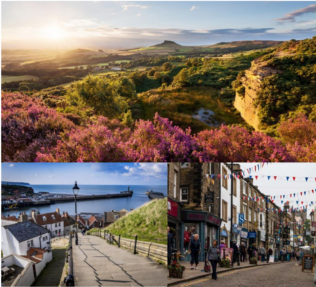
Top: A view across the North York Moors National Park. Bottom left: Whitby, a historic seaside town in the eastern district of Scarborough. Bottom right: The town of Skipton in the western district of Craven.

North Yorkshire is England's largest county , spanning over 3,500 square miles – that's three times the size of Luxembourg. 85% of this area is classified as ' super sparse ' due to its intense rurality and low population density.